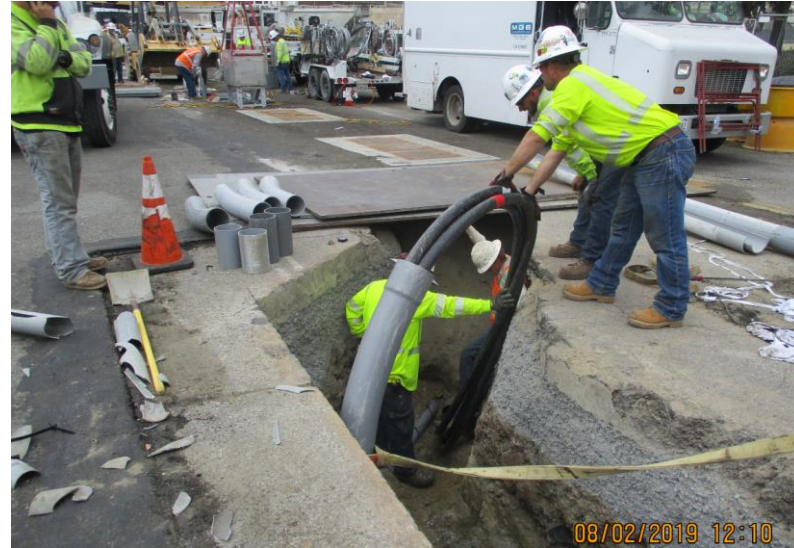
Routing from Splice box to termination point