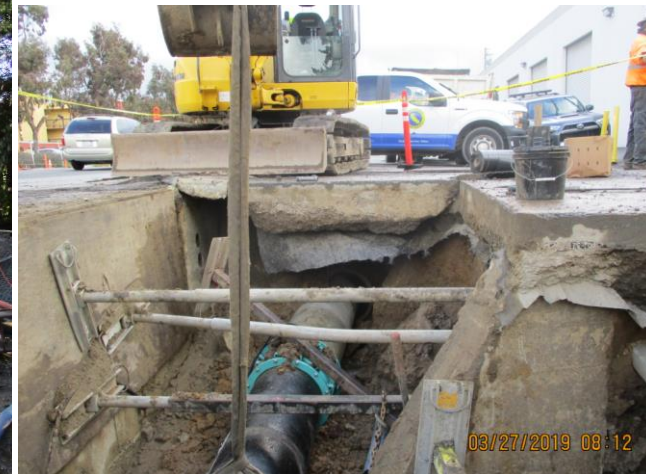
Water main tie in East Grand Ave.

CalWater Relocation – completed April 2019