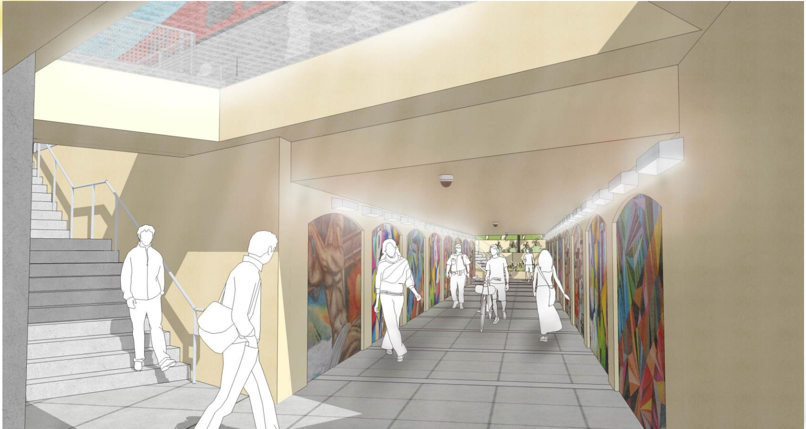
Renderings of Underpass - Station Access