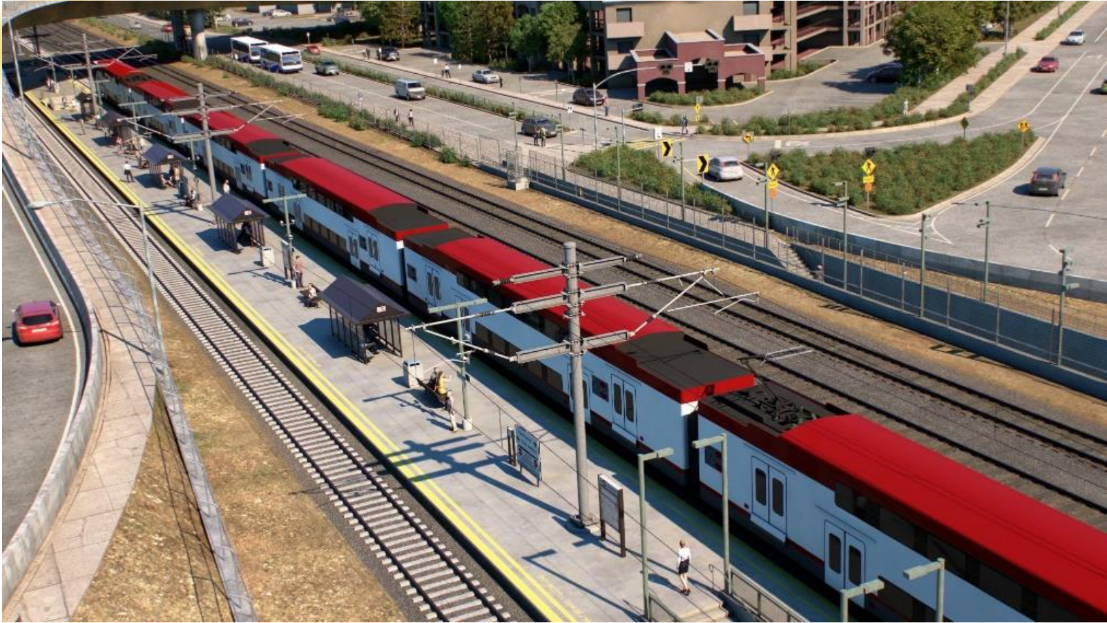
Renderings of Center Platform – Looking North