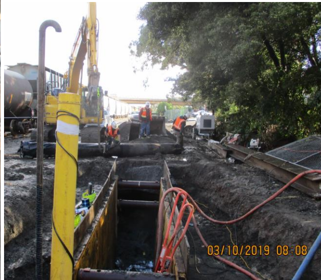
18 inch water main East side UPRR track