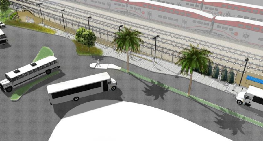
Renderings of Shuttle Drop off Area – Poletti Drive