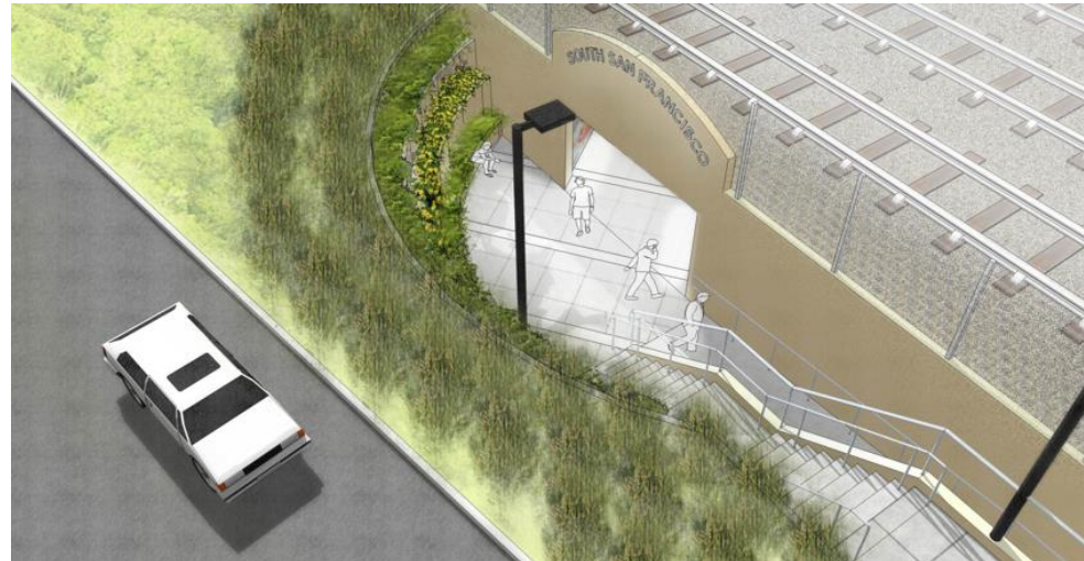
Renderings of East Station Access – Poletti Drive