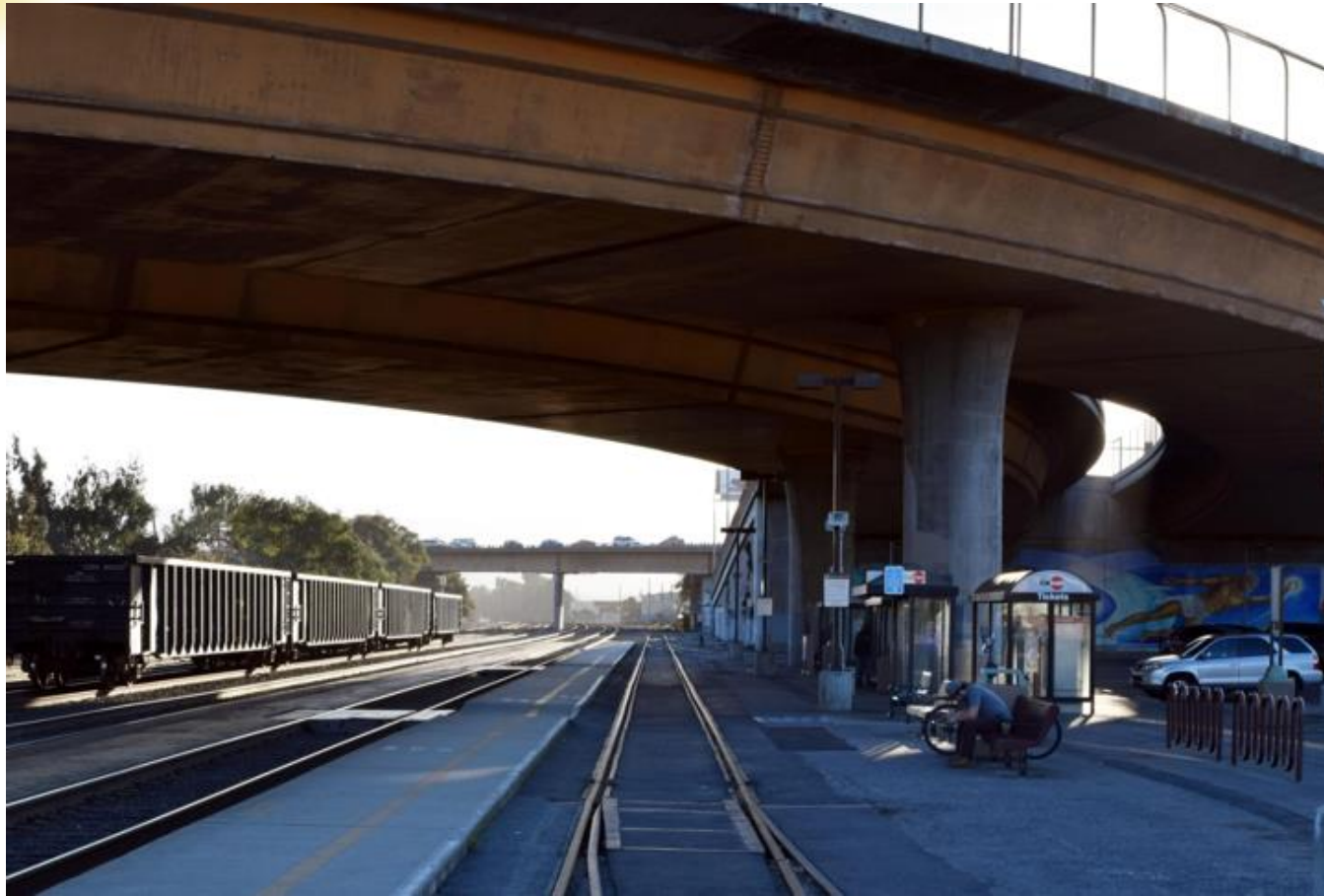
Existing Platform – South San Francisco Station Boarding