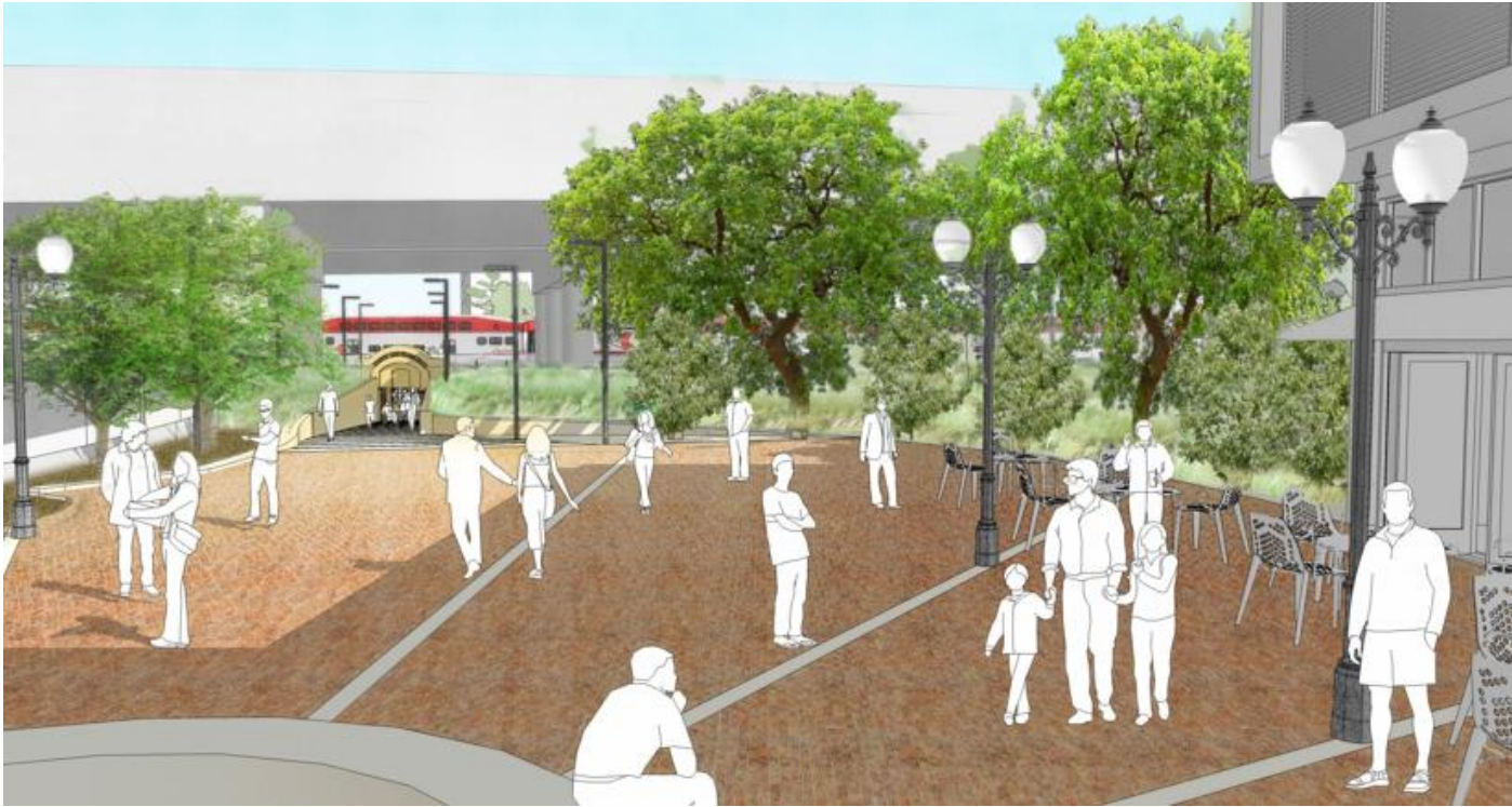
Renderings of West Plaza - Station Access