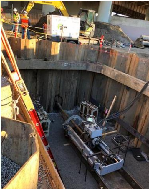
Shoring and Main installation - West Plaza