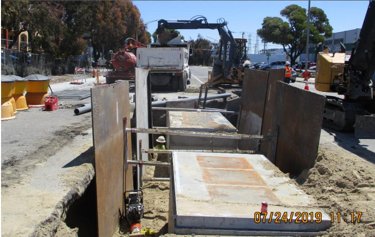
Splice boxes on Grand Avenue

PG&E Electric Relocation – completed Sept. 2019