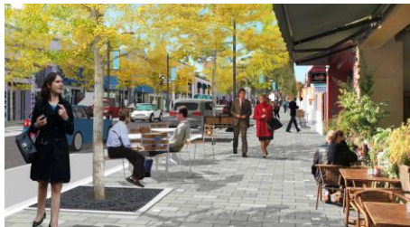
Streetscape Improvements: Burlingame Avenue Bike & Pedestrian Project