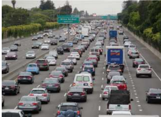
US 101 looking south toward the Willow Road Overpass during the AM commute peak