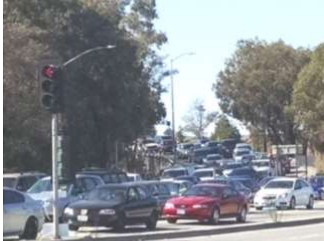
Southbound off-ramp from US 101 to southbound Woodside Ride during PM commute peak