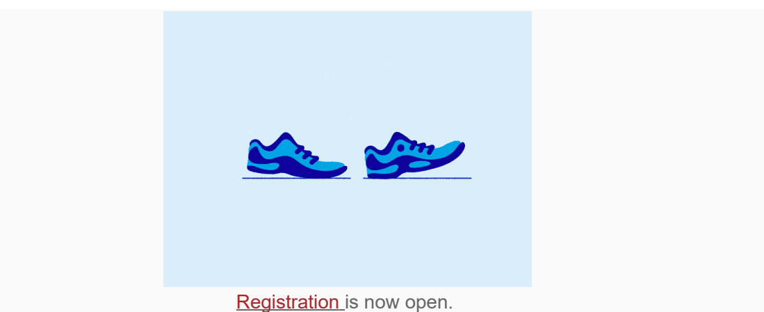
registration is now open.