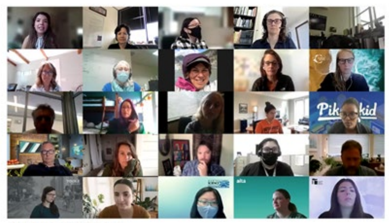
2021 SMC SRTS Summit